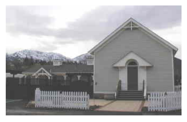
City of Clayton 2017

This local historic building was originally built as the Methodist Episcopal Church in the 1860s and acquired by the Congregational Church Christian Endeavor Society in 1896. After its services ended in 1916, volunteer trustees maintained the building for community use until the Loma Prieta Earthquake in 1989, when they deeded the property to the City. Meetings for Clayton City government were once held in the building until the new Community Library was completed in 1995. The Clayton Redevelopment Agency restored and added bathrooms and a full kitchen to the building, which was completed in 2001. Sidewalks, street lamps, and an enlarged parking lot adjacent to the site were added during the completion of the downtown revitalization of Center Street by the Redevelopment Agency.